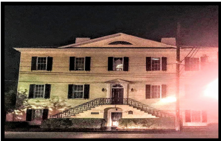
Home of Sarah and Angelina Grimke', who later became abolitionist. Their family home still stands in Charleston, SC.

The book, The Invention of Wings by Sue Monk Kid is about the life of Sarah Grimke' and Angelina Grimke' and the stories of one the their slaves that they emancipated. http://www.pbs.org/wgbh/aia/part4/4h2939t.html , this website has one of Angelina Grimke's speech against slavery.